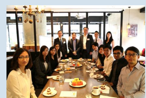
Breakfast meeting: group photo